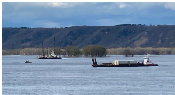
Brennan Marine (La Crosse) tugs remove rail car containers from the backwaters of Winneshiek Slough south of De Soto and north of Ferryville, Wisconsin.

U.S. Fish and Wildlife Service and Wisconsin DNR personnel responded to the recent train derailment near De Soto, Wisconsin. Cars derailed were carrying lithium batteries, paints, and compressed oxygen. The engines leaked a small amount of diesel fluid into the river with most of the train cars derailing on the Wisconsin side of the tracks. Two containers floated down the Winneshiek Slough and were retrieved by commercial barge (Brennan Marine, La Crosse), neither container contaminating the Refuge.