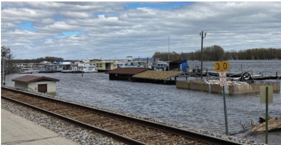
Lansing Marina shows evidence of near record flood levels during the spring flood of May, 2023 when levels reached 19.61 feet at the Lansing gauge.