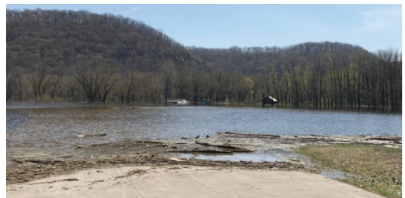
Flood waters engulf the parking lot and buildings at Village Creek Landing, Lansing, Iowa during Spring, 2023.