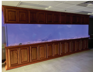
The new 1,260-gallon aquarium is installed and stands ready to accommodate inhabitants of the Mississippi River, at the Allamakee County Driftless Area Education and Visitor Center.