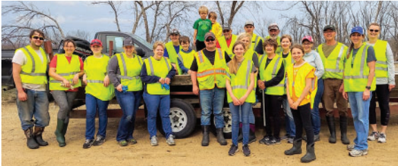
Volunteers take a break after collecting the 3-mile-long dike roadsides along Wisconsin Highway 82 across the Mississippi River at Lansing, April 23, 2022.

It was an impossible spring along the Mississippi River, as you all are well aware. The Board had made plans for the Annual Pool 9 River Clean Up, but it was not to be. Conditions quickly rose to the dangerous level as record crests occurred the following weekend of the planned event, reaching the fourth highest level ever recorded in Lansing at 19.6 feet. Flood waters made it too dangerous to send volunteers out to collect debris, and there will be another year. For your information, record water levels are as follows: 1965 – 22.5 feet on 4/24 1965, 19.93 feet on 4/21/2001, 19.90 feet on 6/20/1880, and 19.61 feet on 4/28/2023.