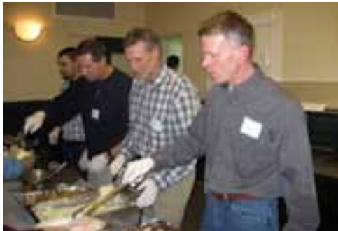
USF&W staff serves turkey dinner to volunteers.

Watch as the sun rises farther to the north each morning along the Wisconsin bluffs that border the river valley, but yet we remain locked in the grasp of "ole man winter". Perhaps spring and warm temps have returned to the upper Midwest as you read this, and I'll never complain about cutting grass again!